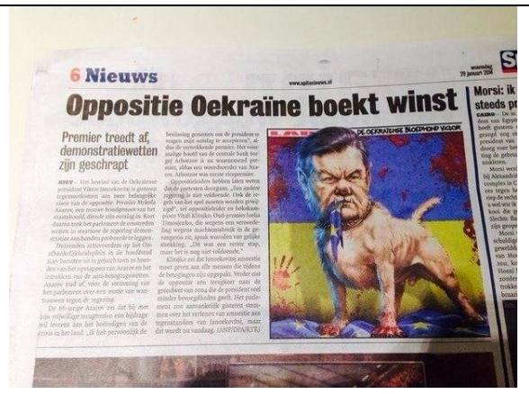
Jan 30 at 17:01

PHOTO [PAGE 175, the bottom one]: Inscription on the wall: "THESE PEOPLE ARE INVINCIBLE!"